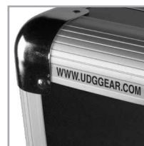
Corrosion resistant aluminum profiles with strong rounded corners